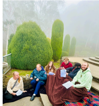
Recently Bendigo Sunday Night Bible Study held out on Mount Macedon.