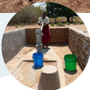
Safe, potable water is transforming health in communities.