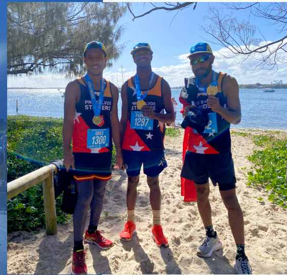
Left: Preparing to run. Above: Proudly wearing their medals. Below: Visiting the Gold Coast Temple..