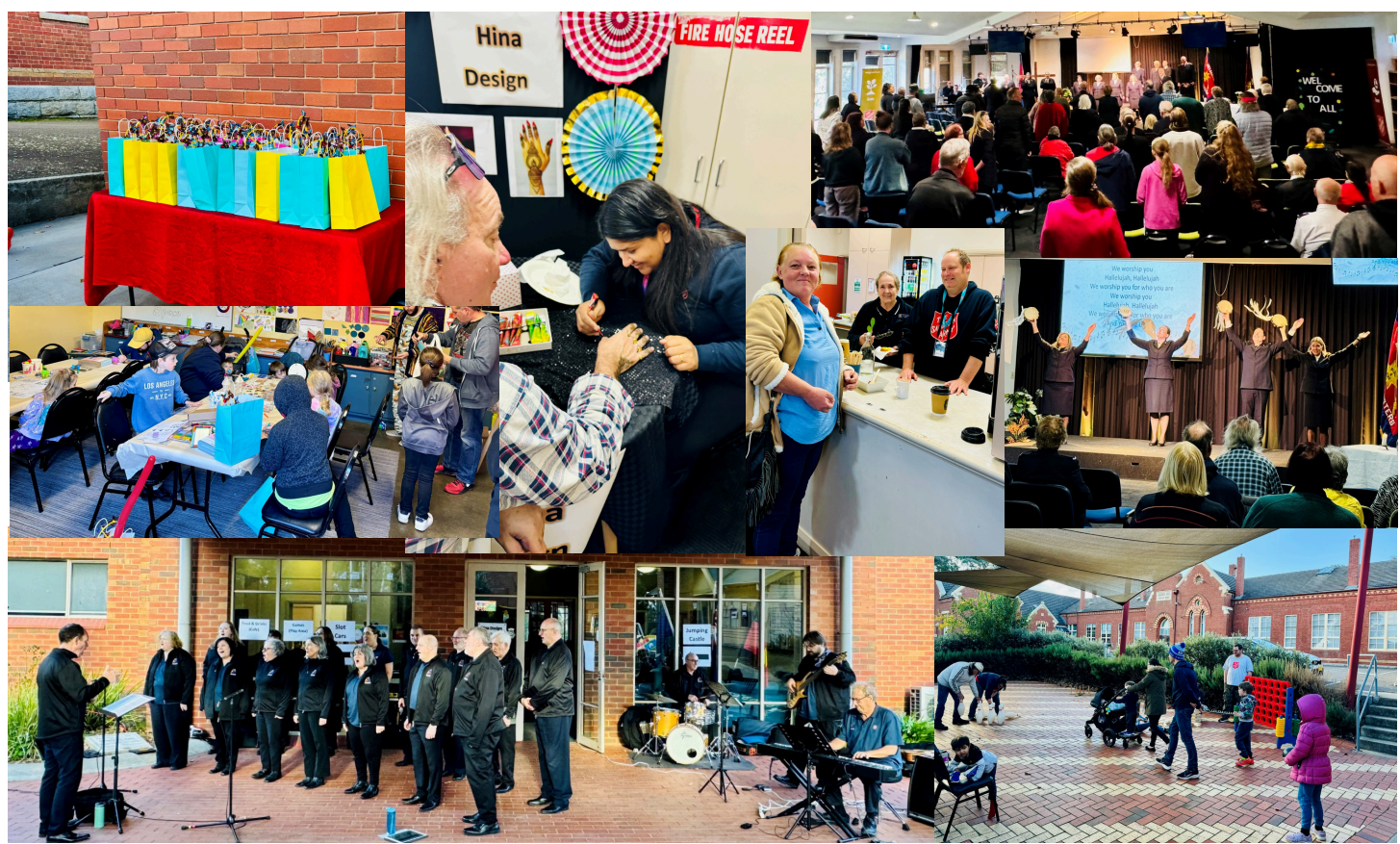
Photos from the family fun day and church service with the Melbourne Staff Songsters