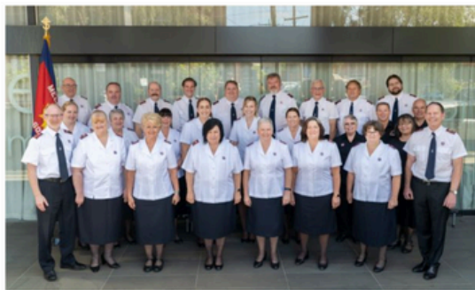
65-71 Mundy Street, Bendigo

10am: Family Worship led by Staff Songsters