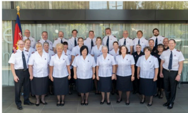
65-71 Mundy Street, Bendigo

10am: Family Worship led by Staff Songsters